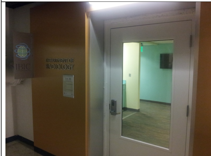
Continue down the hall. Welcome to the Integrated Brain Imaging Center .