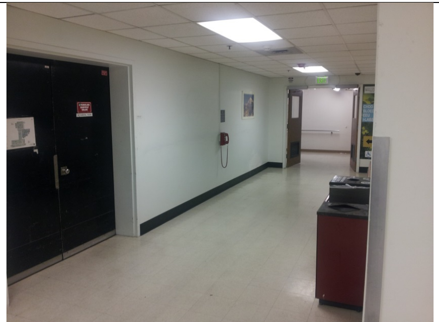
Turn RIGHT at the junction.