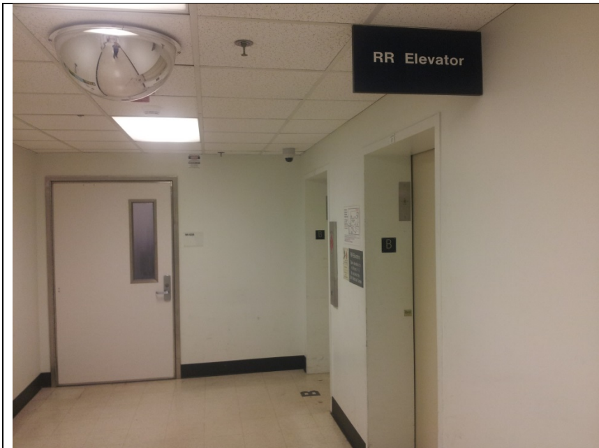
Upon exiting elevators, turn LEFT.

Please press down and go to the BASEMENT (B).